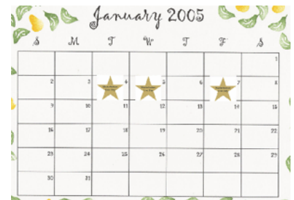
Calendar with stick-on stars positively reinforces masturbation-free days.

2) Calendar with stick-on stars – A positive reward system. If the little factory was not activated, the individual can place a golden star on that day.