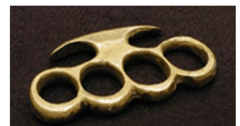
Just try to activate MY “factory!”

6) Brass Knuckles – “If a terrorist came into your home with the intent of doing physical harm, you would protect yourself,” says Elder Packer. “The same is true with those intending to tempt our youth sexually. If any one approaches an LDS boy with the intent of activating his little factory, the result should be immediate and disabling. The brass knuckles are an effective method of deterrent – especially against the queers.”