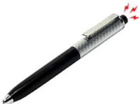
The shock stops the “little factory” from activating.

*Removing all mirrors from the home. * No internet * Only quick showers. * At least 4 layers of clothing around the crouch, especially at night. * Reading only church approved material. * Praying at least six times daily. * Getting up as soon as you wake. * Instead of reaching for your little factory, reach and grab the Book of Mormon (The IRON rod).