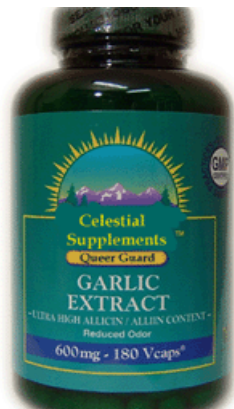
Wards off those who want to activate your factory.

4) Calming Religious Music CD – When someone feels the little factory activating, the CD will slow it down. “Most secular music is inappropriate,” said Elder Packer. “When the beat of the music matches the same rhythm as in sexual intercourse it becomes an activator for sexual feelings. Calm music is the only acceptable kind.”