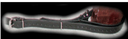
Tying the dominate masturbating arm to the bedpost can deter the sinner from activating the “factory” during times of sleepiness.

7) Wrist Ties – Meant for extreme situations, the wrist ties can be used to tie the dominant masturbating arm to the bed post at night to discourage playing with the little factory during times when the individual is not fully awake or aware.